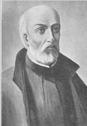
St. John de Brebeuf